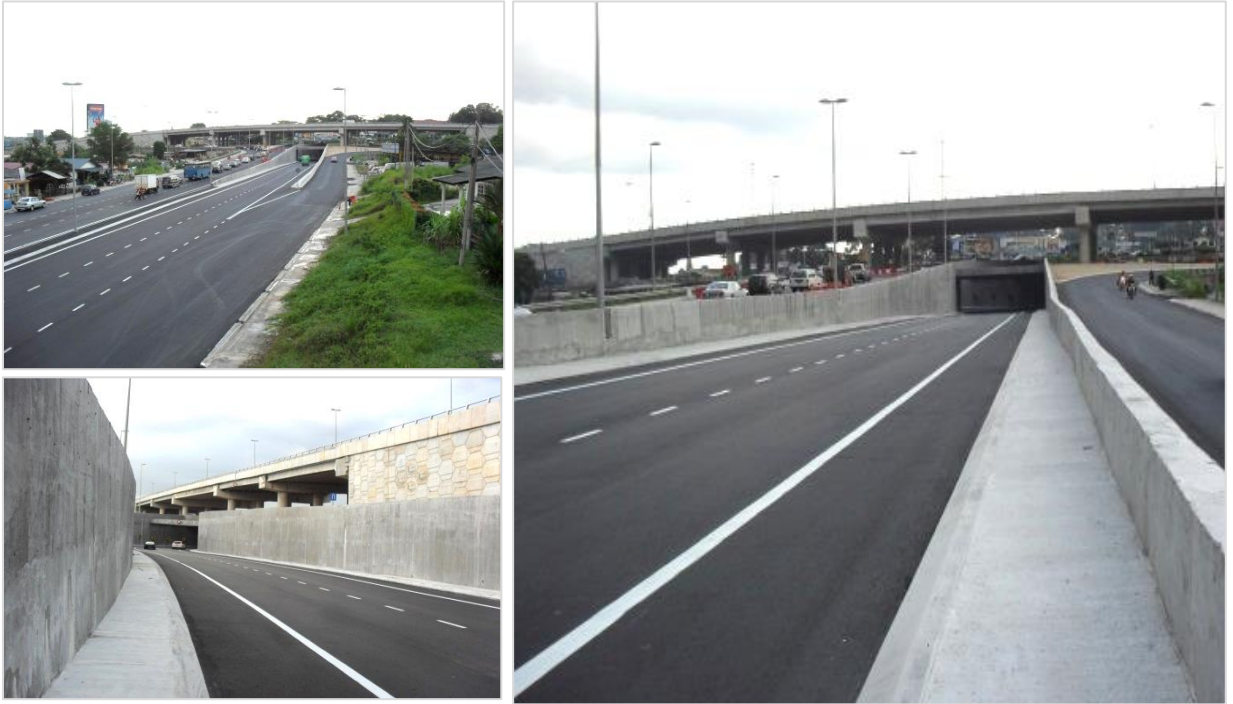
Membina Dua Persimpangan Bertingkat di Jalan Tampoi, Johor Bahru, Johor Darul Takzim