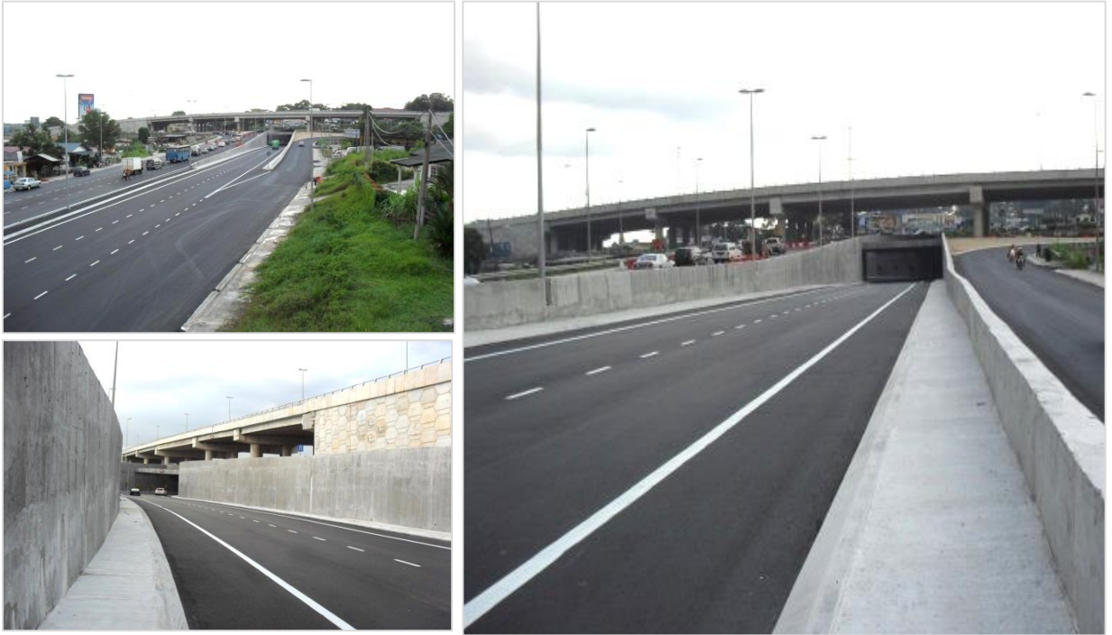
Membina Dua Persimpangan Bertingkat di Jalan Tampoi, Johor Bahru, Johor Darul Takzim