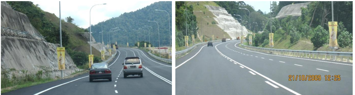
Upgrading of road from Seremban to Kuala Pilah, Negeri Sembilan (Phase 1 : Senawang Junction to Bukit Putus)