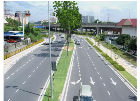
Connection Road from Taman Alam Damai to East-West Highway, at Cheras, Kuala Lumpur