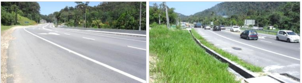
Upgrading of road from Seremban to Kuala Pilah, Negeri Sembilan (Phase 2 : Bukit Putus to Sekolah Kebangsaan Ulu Bendu)