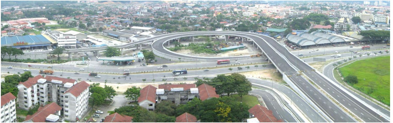
Proposed Trumpet Interchange from Federal Route 1 to Pasar Borong, Kuala Lumpur